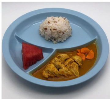
Curry Chicken Rice