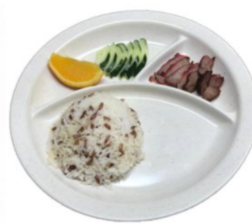
Char Siew Rice